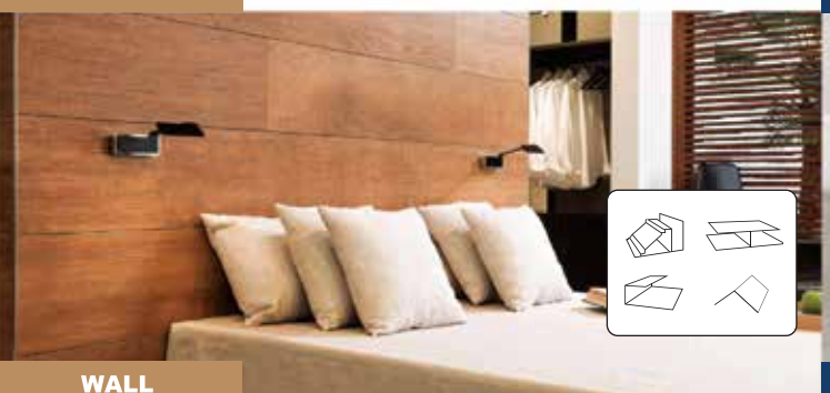
EPanel Wall Panel has the wide range of varieties which suits your wall at Home, Office, Show Room & etc. Which gives you a high quality, elegant finish.