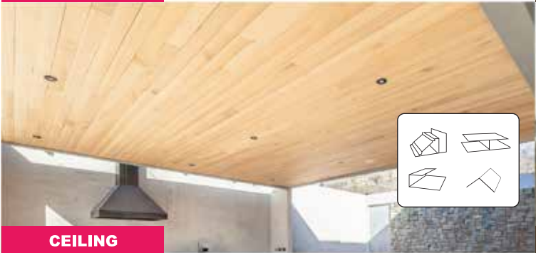
Ceiling Sheets are exclusively produced for ceiling which gives you the 100% natural wood finish, it is being produced minimizing all health Hazards, under all standard health and safety guidelines.