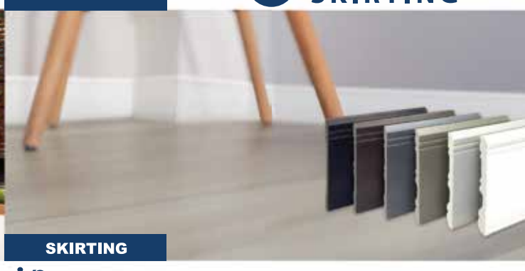
2 /O PS Skirting is a high quality product which gives you the right finish for your flooring, crack free, water proof, durable 2/0 PS Skirting are available with wide range of colors & designs for your choice.